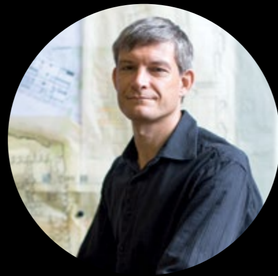
KEITH STEAD – OCULUS

AJ+C Architects are renowned for the design of intelligent live, work, play and hybrid environments. South Quarter is their latest in a long line of imaginative and award-winning projects that are helping shape the future of Sydney. Their competition-winning South Quarter precinct and SQ1 tower design raises the bar bringing together architecture, expansive new public domain and a network of recreational spaces in one extraordinary address.