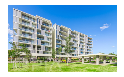
1601 / 39 Rhodes St, Hillsdale $950.000