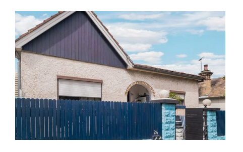
24 Marion St, Leichhardt $3,000,000